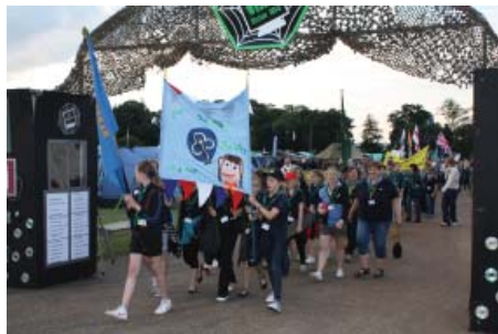
Going to the Opening Ceremoney