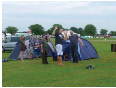
Happy campers pitching tents.