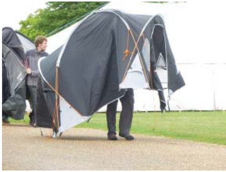
Is it a bird? Is it a plane? No! It's a tent going for a walk!