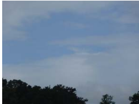
Don't worry! It has not rained all day; here is proof of blue skies! It's not rain, its liquid sunshine.