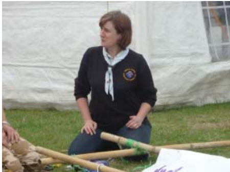
Constructing a gate way.