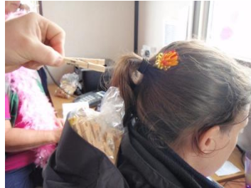
You've been pegged