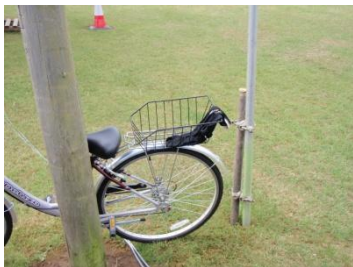
Somebody missing a pair of undies...?