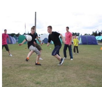
Staff playing football